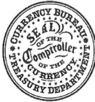
Acting Comptroller of the Currency

IN TESTIMONY WHEREOF, today, June 1, 2020, I have hereunto subscribed my name and caused my seal of office to be affixed to these presents at the U.S. Department of the Treasury, in the City of Washington, District of Columbia